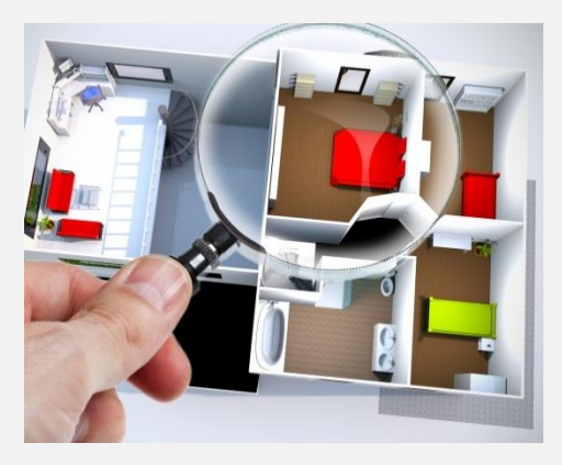
Home Search: After complete assessment of Client's needs.