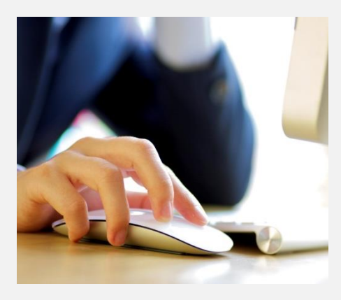
Administrative Formalities: In accordance with local rules.